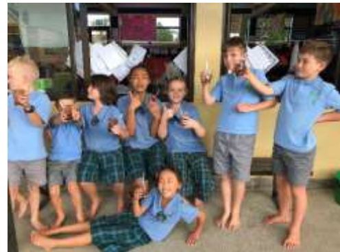
Garden Week 2019 - A fun filled week together!