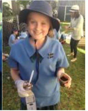
Activity: Planting our own little seedlings to monitor over the holidays