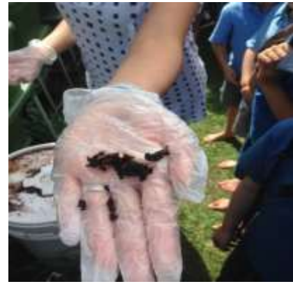
Activity: Learning about our Hungry Bins (Our worm farm)