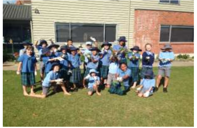
Activity: Caring for plants and weeding the gardens.