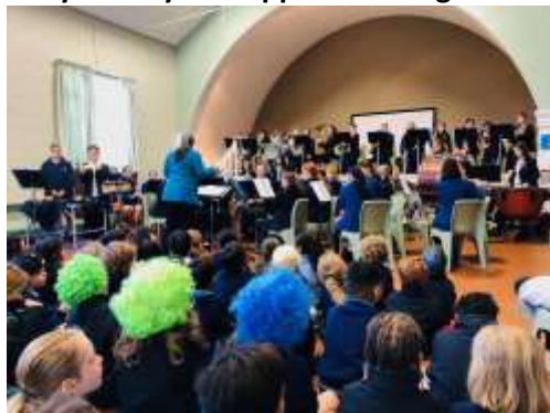
Enjoying St Mary's orchestra on 'Wig Wednesday'

Thank you for your support of this great cause.