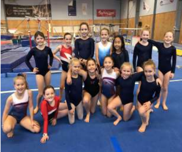
Year 5 & 6 gymnasts from last week's festival