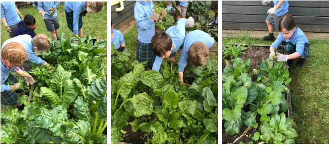
Gardeners hard at work