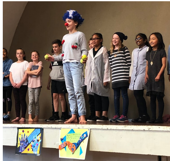
Room Six Assembly

We are now taking collection for white elephant toys, books etc for the Fair. Please bring them to the office.