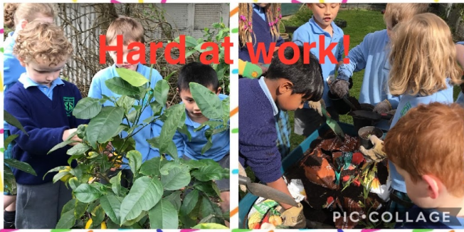
Gardening group showing their green fingers