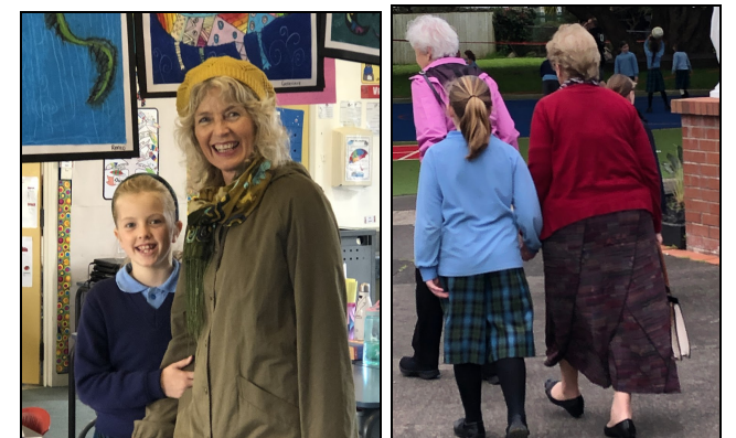
Enjoying the day