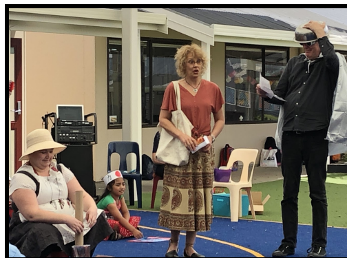
Dare to Explore: Past, Present and Future