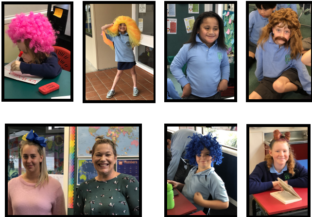
Teaching and Learning in Style...

For a short time, you can still donate online at our GSS Wig Wednesday Page . Thanks so much for your support!