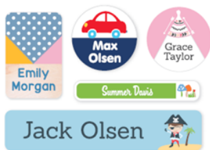
PERSONALIZED NAME LABELS

Orders can be placed anytime during the year and you can order as often as you like. Feel free to share our code with your family and friends too!