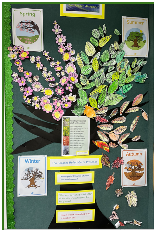
'The seasons reflect God's Presence' - Ecclesiastes 3: 1-8