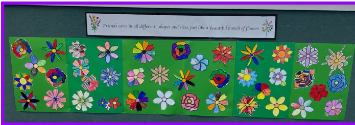
'Friends come in all different shapes and sizes just like a beautiful bunch of flowers'

In Room 3 & 4 we have been learning about how to be a good friend and what makes a good friend. All year we have been working on celebrating our uniqueness and individuality. This relates well to our RE topics and our Mitey topic. During the God strand in RE, we discussed the seasons and God's creations and how beautiful and unique they all are (including us!). In Mitey, we have been learning about our feelings and how to express our feelings to others. We realise it's important to value others' opinions and their emotions.