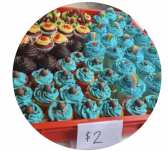
GSS PTA Group · 22 participants

Visit https://tinyurl.com/2p846jkm to join us. (Easiest on your phone).