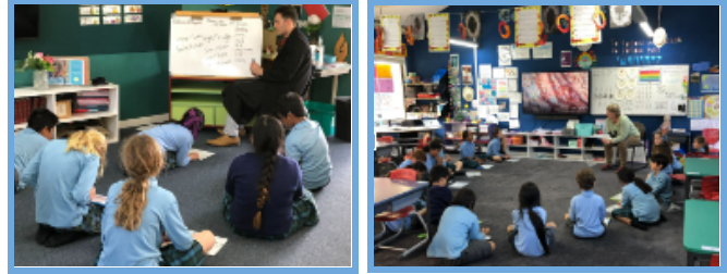
Structured literacy in action - Ākonga use small whiteboards to record their learning.