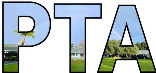
Good Shepherd School