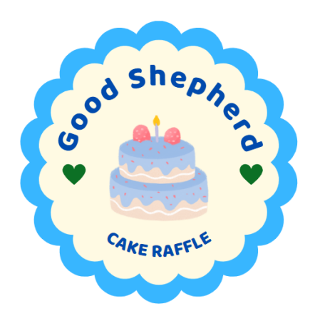
Room 8 cake raffle - Bring your spare coins. Available before & after school or come into the office. $2 for 1 ticket or $5 for 3.